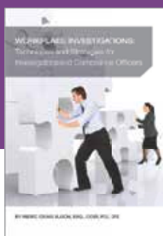
Workplace Investigations Strategies to help you handle the internal investigations process