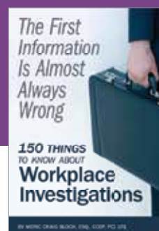
The First Information Is Almost Always Wrong Tactics to help you master the art and science of workplace investigations